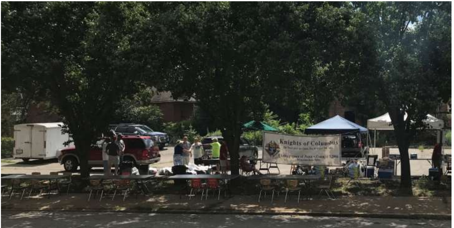
This is a picture from the 2018 Solidarity BBQ

We will gather on the lot on Hamilton and Minerva prior to 8:45. Bring yard tools and a pair of work shoes if possible. We will assign tasks at 8:45 and start working at 9:00. Council #12986 and the Knights and Ladies of St. Peter Claver will serve lunch to the workers and community at noon.